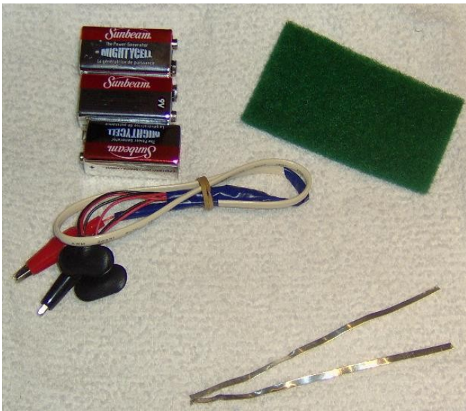
HOW TO ASSEMBLE your own generator

Colloidal Silver Homemade Generator Kit ( 27 V) $55 (includes 2-3 inch 0.9999 silver wire).